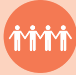
PILLAR I. COMMUNITY

COMMUNITY IMPACT – DEDICATED TO IMPROVING THE EMOTIONAL AND SOCIAL WELLBEING OF FAMILIES THROUGH INTENSIVE COUNSELLING, INNOVATIVE COMMUNITY OUTREACH, AND IMPACTFUL ADVOCACY