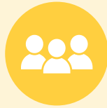
PILLAR II. PEOPLE

PEOPLE, CULTURE & GOVERNANCE – PROMOTE POSITIVE ORGANIZATIONAL CULTURE THAT RESULTS IN HIGH MORALE, RETENTION, AND SATISFIED CLIENTELE