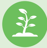
PILLAR III. SUSTAINABILITY

ORGANIZATION SUSTAINABILITY – EXECUTE FUNDRAISING AND FINANCIAL MANAGEMENT STRATEGIES THAT BUILD STABILITY AND FLEXIBILITY BOTH TODAY, AND IN THE FUTURE